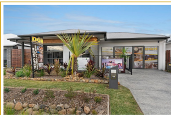
BELLS REACH, CALOUNDRA

Be inspired by our award-winning designs