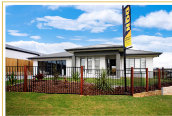
CALA - PACIFIC COVE, PIMPAMA