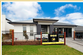
LUCIA - PACIFIC COVE, PIMPAMA