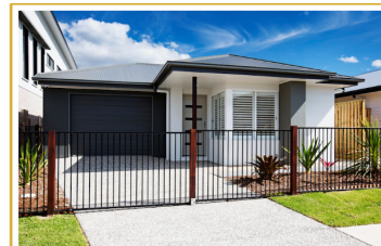
YARRA - YARRABILBA