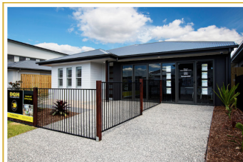
PRESTON - YARRABILBA